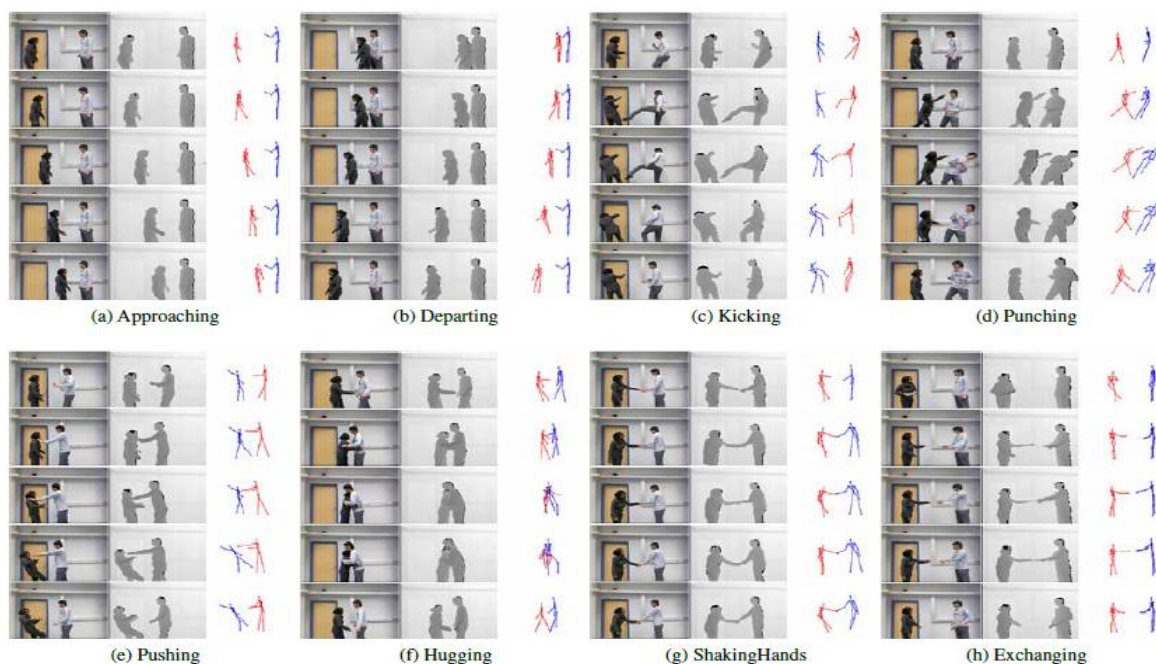
Figure 1: Visualization of our interaction dataset. Each row per interaction contains a color image, a depth map, and extracted skeletons at the first, 25%, 50%, 75%, and the last frame of the entire sequence for each interaction: approaching, departing, kicking, punching, pushing, hugging, shaking hands, and exchanging. A red skeleton indicates the person who is acting, and a blue skeleton indicates the person who is reacting.

We collect two person interactions using the Microsoft Kinect sensor. We choose eight types of two-person interactions, motivated by the activity classes from, including: Approaching, departing, pushing, kicking, punching, exchanging objects, hugging, and shaking hands. Note that all of these action categories have interactions between actors that differ from the categories performed by a single actor independently. These action categories are challenging because they are not only non-periodic actions, but also have very similar body movements. For instance, ‘exchanging object’ and ‘shaking hands’ contain common body movements, where both actors extend and then withdraw arms. Similarly, ‘pushing’ might be confused with ‘punching’. All videos are recorded in the same laboratory environment. Seven participants performed activities and the dataset is composed 21 sets, where each set contains videos of a pair of different persons performing all eight interactions. Note that in most interactions, one person is acting and the other person is reacting. Each set contains one or two sequences per action category. The entire dataset has a total of 300 interactions approximately. Both color image and depth map are 640 * 480 pixels.